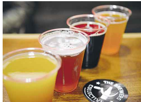
The Brewers Collective in Bay Shore makes lagers, chocolate stouts and more.

W ith a new season comes a fresh crop of social spots that are giving the night life crowd more options for hanging out, sampling craft beer and even local hard cider.